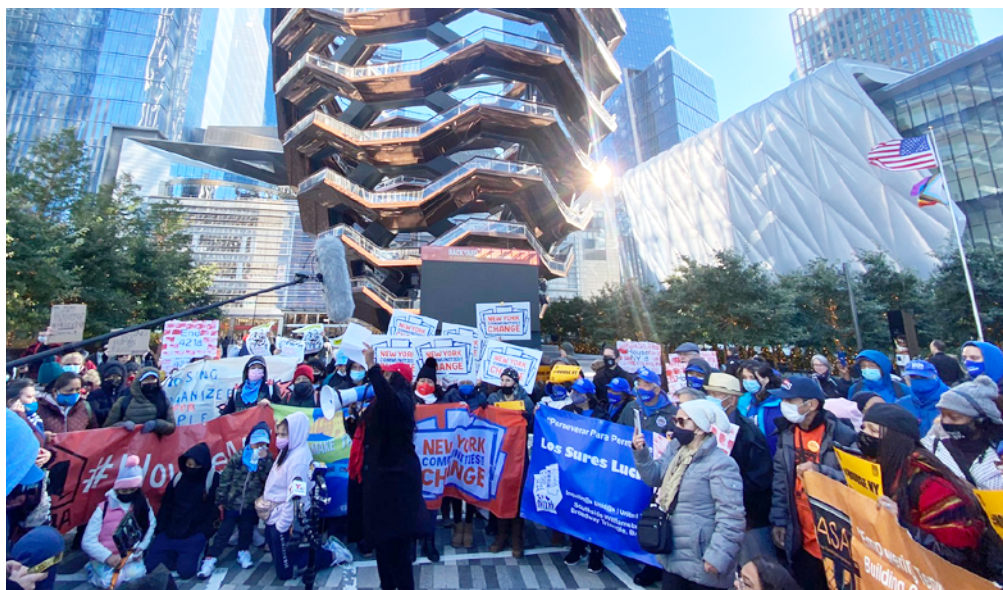
Tenants and Homeless New Yorkers protest outside of Hudson Yards, Manhattan. Hudson Yards benefits from billions in reduced property taxes annually thanks to 421-a

service revenue at $5,893,548, 5 but also includes $1,405,820 in investment income. 6 RSA reports over $61,090,888 in total assets, mostly investment securities. 7 Not-for-profit 501(c)(6) organizations are not required to pay taxes on income received from investment assets so long as they are related to their mission.