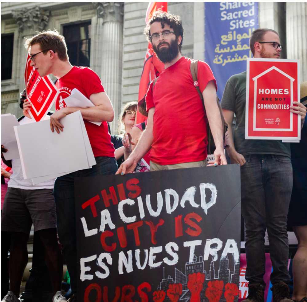
Protestors outside of the New York Public Library fighting for Good Cause Eviction

In 2018 and 2019, REBNY reported spending $800,204 with the law firm Stroock & Stroock & Lavan, which represented REBNY in its successful lawsuit to overturn the ban on charging brokers fees to tenants. 47