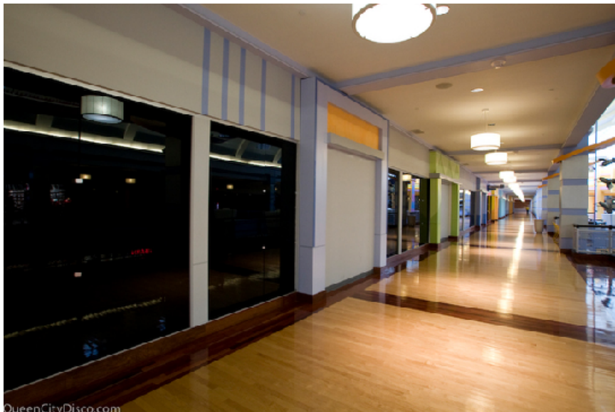
Vacant storefronts in the Cincinnati Mall, a Bass Pro-anchored mall in Greater Cincinnati. The mall is struggling with a 65% vacancy rate. See http://queencitydiscovery.blogspot.com/2009/03/portrait-of-dead-mall.html

The company's hometown reputation has been damaged by the struggles of the adjacent Wonders of Wildlife, a large non-profit museum, zoo, and aquarium that has struggled despite receiving millions of dollars from city-wide hotel tax revenue, as well as from Bass Pro CEO Johnny Morris. Wonders of Wildlife closed in 2007 citing low attendance, and as of 2010 had begun a renovation that will include connecting the museum directly to the Bass Pro store in a second effort to draw some of the store's visitors to the adjacent publicly-funded attraction. 17