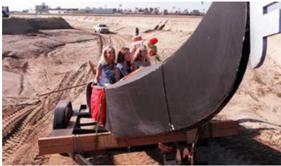
Pro-anchored Grand Canal development in 1999. Neither the store nor the development was ever built.

Bass Pro proposed opening a store as the anchor tenant of the Venetian-themed Grand Canal, a planned mixed-use development adjacent to a derelict canal. A groundbreaking ceremony was held in 1999, but the development fizzled. 40