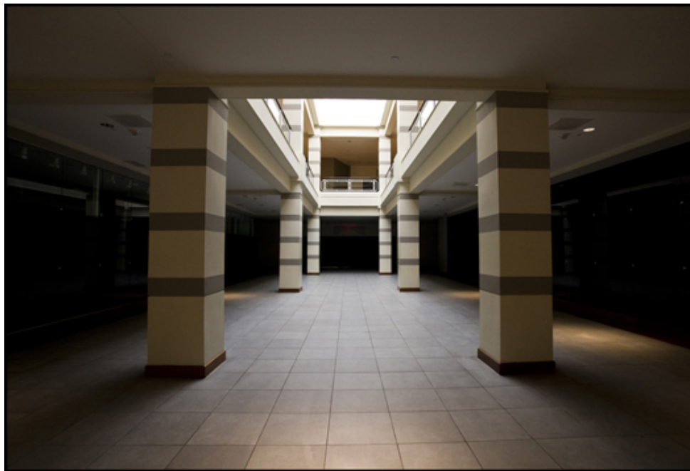
Vacant wing at a Bass Pro-anchored mall in Greater Cincinnati.

When it does attract additional tenants, Bass Pro can sometimes attract existing businesses away from nearby locations – leaving cities like Mesa to deal with problems of vacancy and blight outside of the subsidized area.