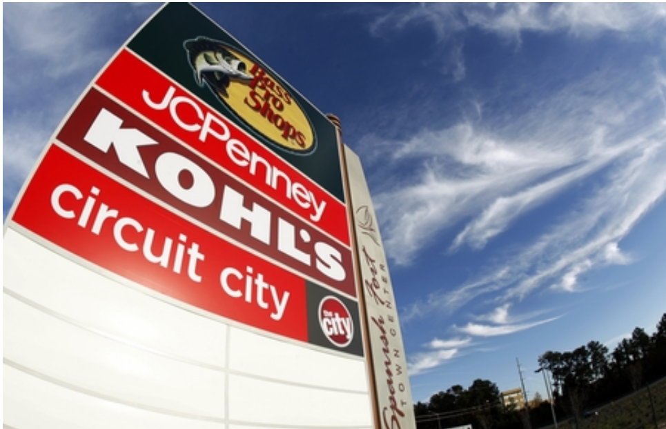
The publicly-financed Spanish Fort Town Center has struggled financially, despite being anchored by Bass Pro.

Bass Pro opened as the anchor tenant of a publicly-subsidized development in the suburb of Spanish Fort. The proposal called for the municipality to use increased sales tax revenues from Bass Pro and the businesses it would attract to pay the debt incurred for construction. One year after opening, the mall was struggling to attract additional tenants, and expected annual sales tax revenues of $1.2 million came in at only $700,000. The lackluster economy likely contributed to the poor showing; Spanish Fort's mayor, as well as store managers at the complex, attributed the problems to the economy. 33