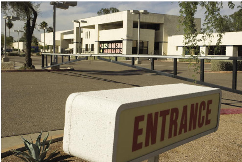
The former site of Scott Toyota after it moved to the Mesa Riverview.

The Arizona Republic recently editorialized that "critics were right when they said that Riverview would cannibalize retail from the struggling Fiesta Mall area." 9 This process created blight in areas of Mesa where businesses left their previous locations in favor of Riverview's incentives (see photo below). 10