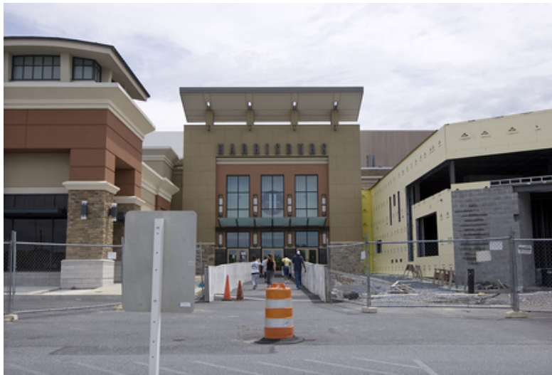
A Bass Pro-anchored mall in Harrisburg has struggled to overcome vacancy and blight.

Despite the amount of taxpayer money at stake, the claims that have justified these public outlays have gone largely unexamined. The following report does the long overdue work of investigating Bass Pro's claims by piecing together information from interviews, newspaper articles, and public records on Bass Pro projects across the country.