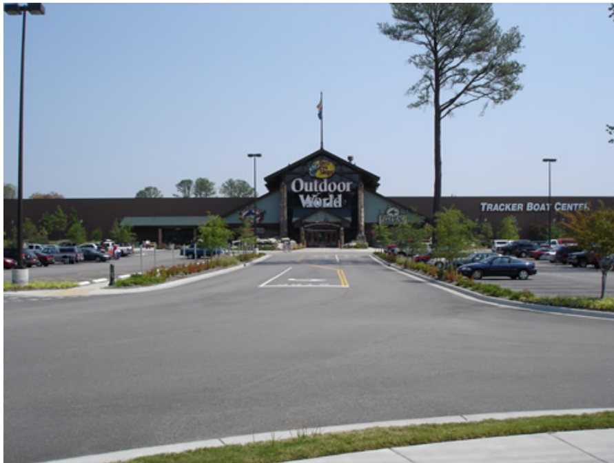
Bass Pro anchors a successful development in Hampton, VA.

The Power Plant development subsequently attracted additional tenants, helped spur additional development in the vicinity, and likely contributed to increased sales and property tax revenues in Hampton Roads in the following years. 27