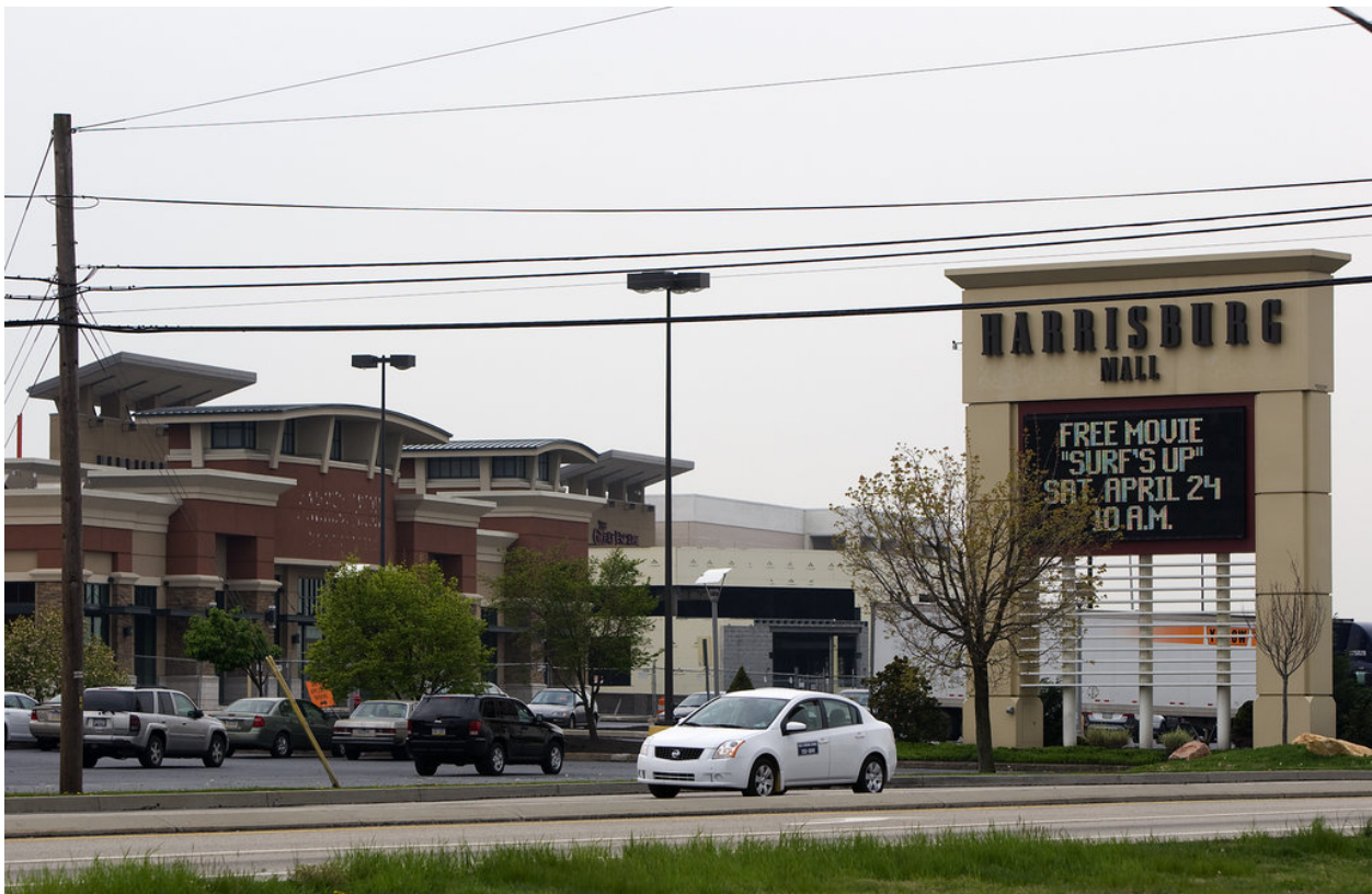
Vacant and unfinished stores at the Bass Pro-anchored Harrisburg Mall.

When government gives taxpayer money to a favored business, it must tax the rest of the public with that missing share. Small businesses, or those less connected to government leaders, or those who cannot hire lawyers and lobbyists to fight for their own subsidies, are left holding the bag. 13